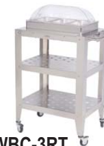
WBC-3RT 3 Pans & 1 Rolltop Lid